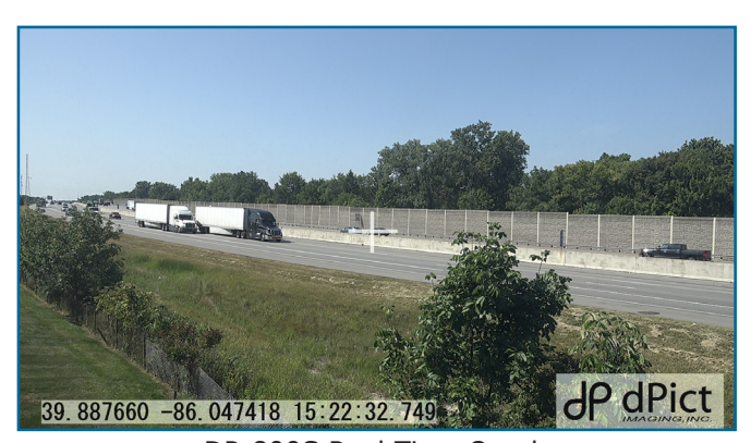
DP-800S Real-Time Overlay