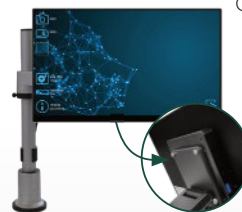
VESA Mounting Option

Order Number MTS156: MTS Monitor with Touch Screen, HDMI to HDMI cable (1), USB cable Type A to Type C (1), USB cable Type C to Type C (2), External Power Supply (EU or US version) - USB Type C, Information for Use (English) 2